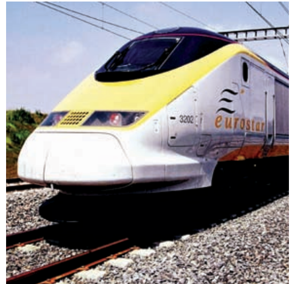
The National Skills Academy for Railway Engineering (the Skills Academy) is an employer-led, industry owned organisation, commercially driven in the best interests of the railway industry.

Railway Engineering includes the design, build, replacement and maintenance of all aspects of the railway infrastructure including track, signalling and telecoms systems and electrification together with the traction and rolling stock that runs on it.