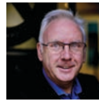
Pete Waterman, Pop impresario, committed railway supporter, and co-founder of the National Skills Academy for Railway Engineering

and Docklands Light Railway networks. We must have the right staff, with the right skills, at the right time to deliver these improvements so vital to the UK economy. This huge programme means that the rail industry must continue to develop the next generation of engineers, which is why I am delighted that the National Skills Academy for Railway Engineering has been given the go-ahead.'