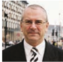
Peter Henty, Transport for London Commissioner

possible training will be vital to the continued success of the UK's railways.'